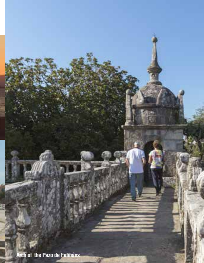
Arch of the Pazo de Fefiñáns