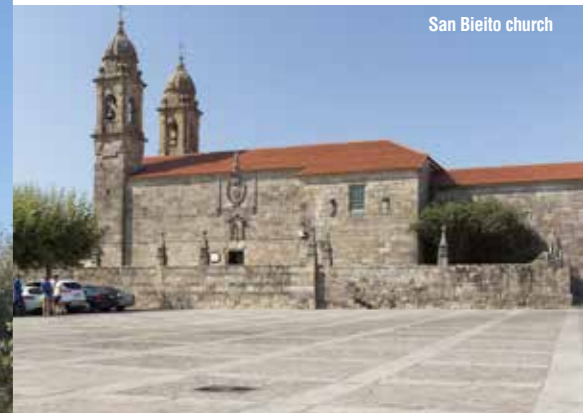
San Bieito church