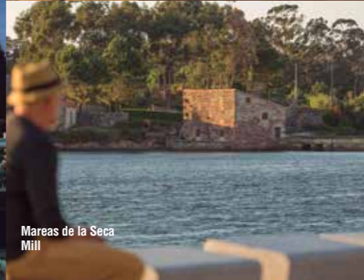
Mareas de la Seca Mill