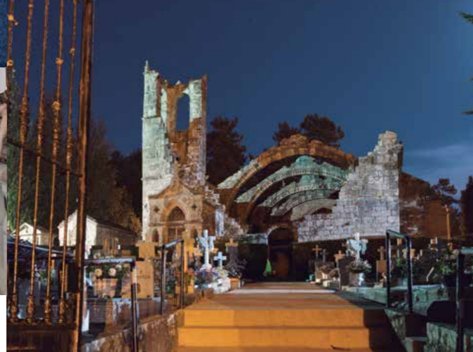
Ruins of Sta. Mariña Dozo (15th century), national monument