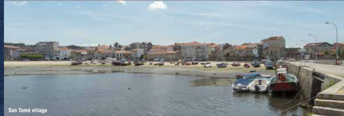
San Tomé village

"CAMBADOS IS AN OUTDOOR ART MUSEUM OR A SETTING OF GOLD JEWELLERY CARVED IN STONE, WHICH REVEALS ITS CHARMS TO WHOEVER VISITS IT"