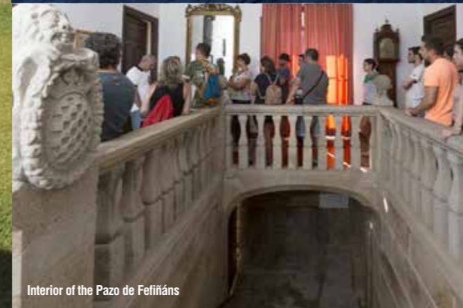
Interior of the Pazo de Fefiñáns